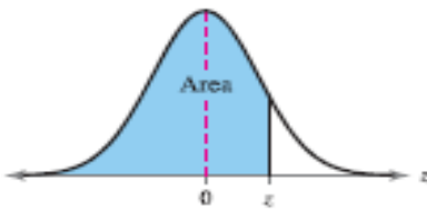
Table —Standard Normal Distribution (continued)